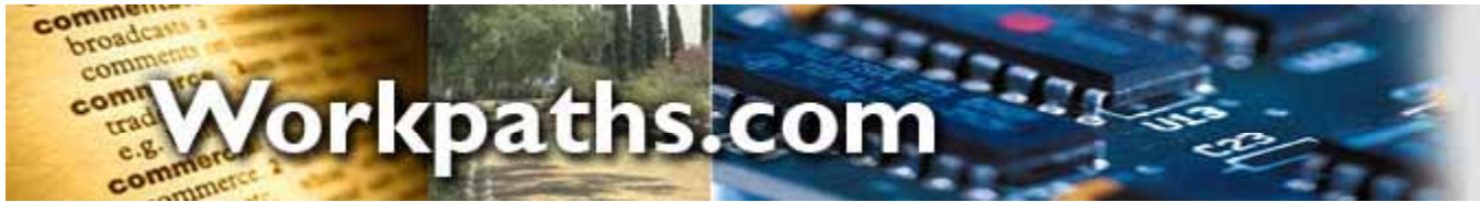
Types of Experiences Offered